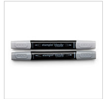
Smoky Slate Stampin' Blends Markers Combo Pack