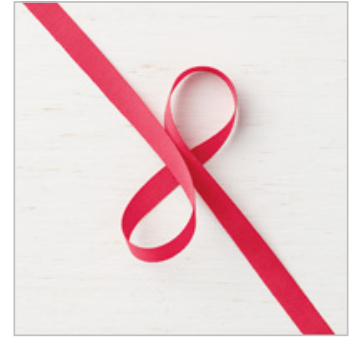
Real Red 3/8" (1 Cm) Cotton Ribbon