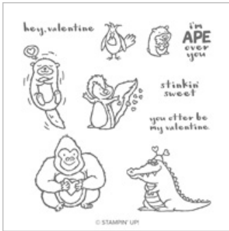
Hey Love Cling Stamp Set