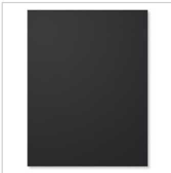
Basic Black 8-1/2" X 11" Cardstock