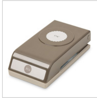
1-1/8" (2.9 Cm) Scallop Circle Punch