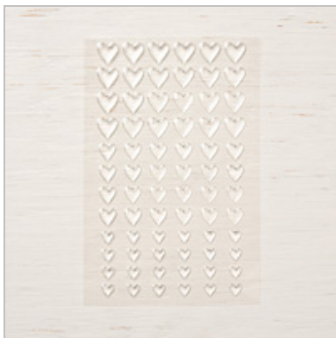
Heart Epoxy Droplets