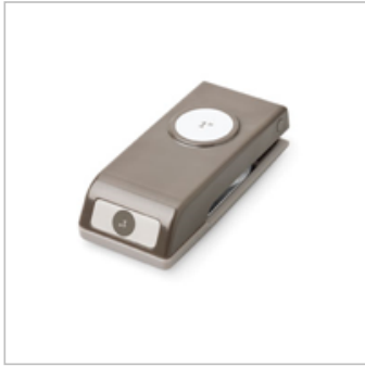
1" (2.5 Cm) Circle Punch