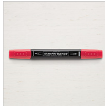
Real Red Dark Stampin' Blends