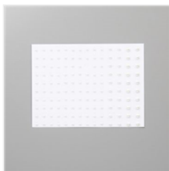
Pearl Basic Jewels - 144219