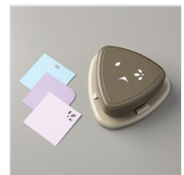
Detailed Trio Punch - 146320