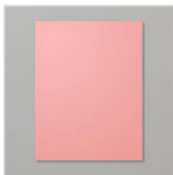
Flirty Flamingo 8-1/2 X 11 Cardstock - 141416