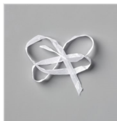
Whisper White 1/4" (6.4 Mm) Crinkled Seam Binding Ribbon - 151326