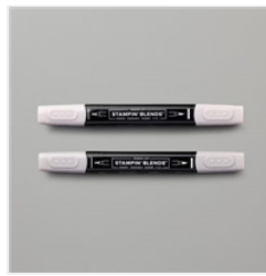
Gray Granite Stampin' Blends Combo Pack - 154886