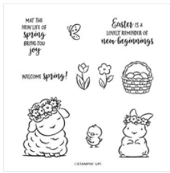
Springtime Joy Cling Stamp Set - 154403

Angie Juda http://orderwithangie.com helpdesk@chicnscratch.com ChicnScratch.com