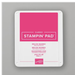
Melon Mambo Classic Stampin' Pad - 147051