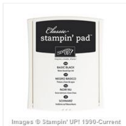
Basic Black Classic Stampin' Pad - 126980