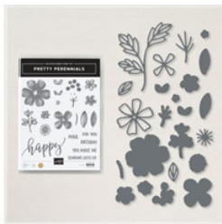
Pretty Perennials Bundle (English) - 156234