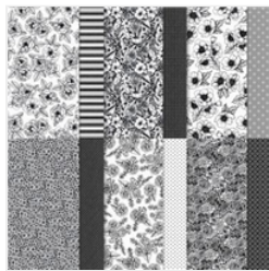
True Love Designer Series Paper - 154281