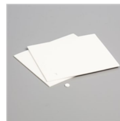
Mini Stampin' Dimensionals - 144108