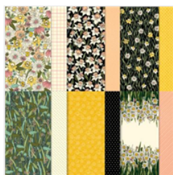
Daffodil Afternoon 12" X 12" (30.5 X 30.5 Cm) Designer Series Paper - 158127