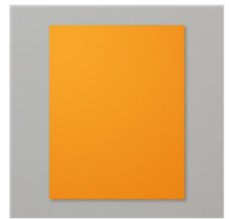
Pumpkin Pie 8-1/2" X 11" Cardstock - 105117