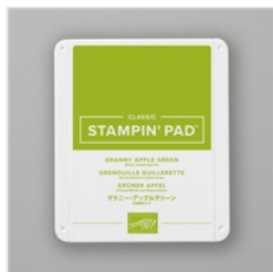
Granny Apple Green Classic Stampin' Pad - 147095