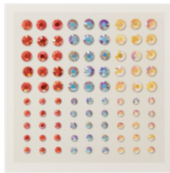
Iridescent Pastel Gems - 160429