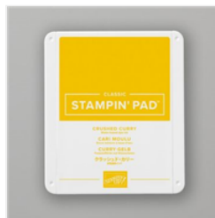
Crushed Curry Classic Stampin' Pad - 147087