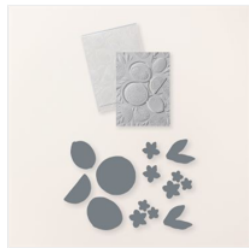
Sweet Citrus Hybrid Embossing Folder - 160644