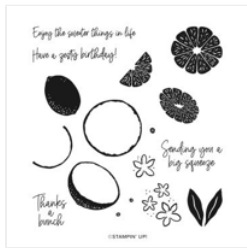
Sweet Citrus Photopolymer Stamp Set (English) - 160641