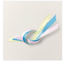
3/8" (1 Cm) Sheer Ribbon Combo Pack - 161635