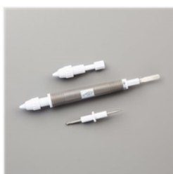
Take Your Pick - 144107