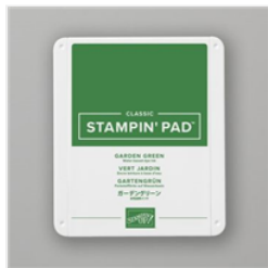
Garden Green Classic Stampin' Pad - 147089