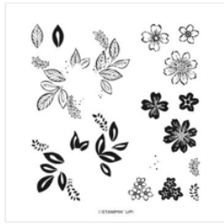
Petal Park Photopolymer Stamp Set - 160571