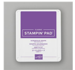
Gorgeous Grape Classic Stampin' Pad - 147099