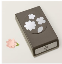
Petal Park Builder Punch - 160576