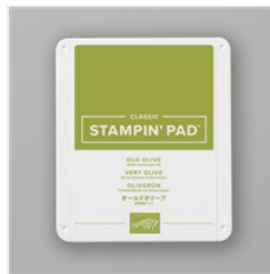
Old Olive Classic Stampin' Pad - 147090