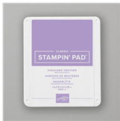
Highland Heather Classic Stampin' Pad - 147103