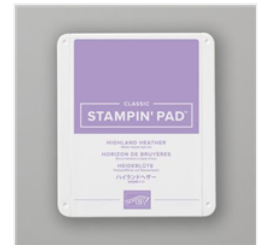
Highland Heather Classic Stampin' Pad - 147103