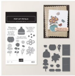
Pop-Up Petals Bundle (English) - 168010

Jackie Beers jackie@jackiebeers.com Bluelinestamping.com