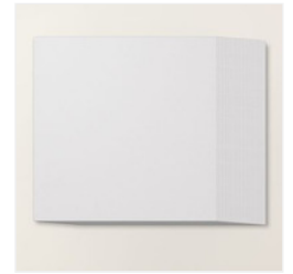
Basic White 12" X 12" (30.5 X 30.5 Cm) Thick Cardstock - 166782