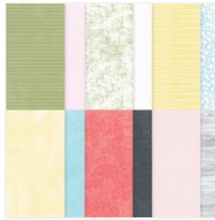
Mixed Up Patterns 12" X 12" (30.5 X 30.5 Cm) Mix-In Designer Series Paper - 166992