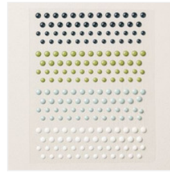
Moody Palette Glossy Dots - 167180