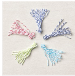
2022-2024 In Color Baker's Twine Pack - 159195