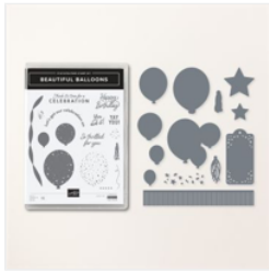
Beautiful Balloons Bundle (English) - 161457