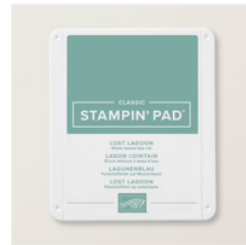
Lost Lagoon Classic Stampin' Pad - 161678