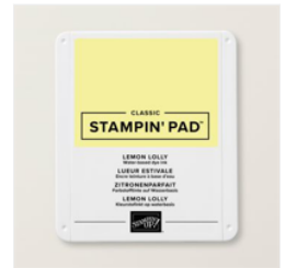
Lemon Lolly Classic Stampin' Pad - 161666