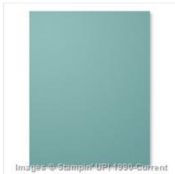
Lost Lagoon 8-1/2" X 11" Cardstock - 133679