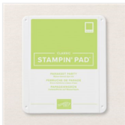
Parakeet Party Classic Stampin' Pad - 159208