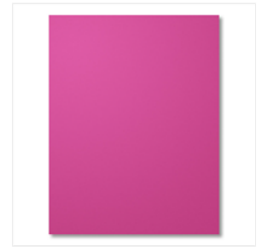
Berry Burst 8-1/2" X 11" Cardstock - 144243