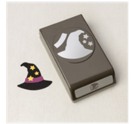
Witch Hat Builder Punch - 159856