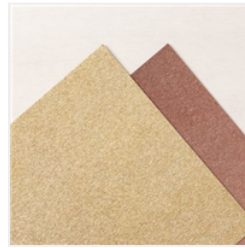
Gold & Rose Gold 6" X 6" (15.2 X 15.2 Cm) Metallic Specialty Paper - 156844