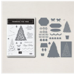
Trimming The Tree Bundle (English) - 162522