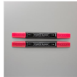
Real Red Stampin' Blends Combo Pack - 154899