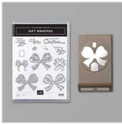
Gift Wrapped Bundle (English) - 155155

Jackie Beers jackie@jackiebeers.com Bluelinestamping.com