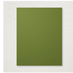
Mossy Meadow 8-1/2 X 11 Cardstock - 133676