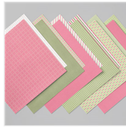
Heartwarming Hugs Designer Series Paper - 153492