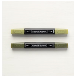
Mossy Meadow Stampin' Blends Combo Pack - 148547