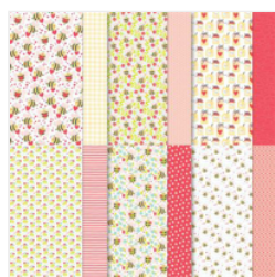
Bee Mine 12" X 12" (30.5 X 30.5 Cm) Designer Series Paper - 162546