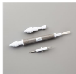
Take Your Pick - 144107