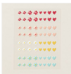
Adhesive-Backed Hearts & Flowers - 162557