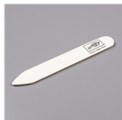
Bone Folder - 102300