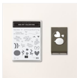
Bee My Valentine Bundle (English) - 162554