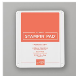
Calypso Coral Classic Stampin' Pad - 147101