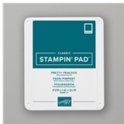
Pretty Peacock Classic Stampin' Pad - 150083