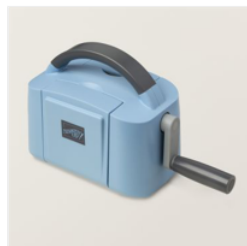
Boho Blue Limited Edition Mini Stampin' Cut & Emboss Machine - 161104