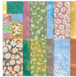
Fresh As A Daisy 12" X 12" (30.5 X 30.5 Cm) Designer Series Paper - 161289