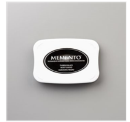
Tuxedo Black Memento Ink Pad - 132708