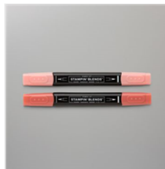
Calypso Coral Stampin' Blends Combo Pack - 154881