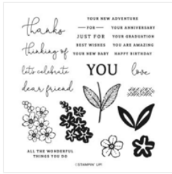
Sentimental Park Photopolymer Stamp Set (English) - 160561