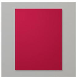
Cherry Cobbler 8-1/2" X 11" Cardstock - 119685