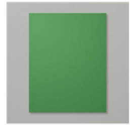
Garden Green 8-1/2" X 11" Cardstock - 102584