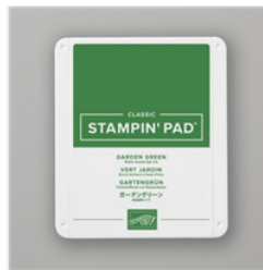
Garden Green Classic Stampin' Pad - 147089