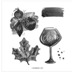
Cheers To The Season Cling Stamp Set (English) - 162309