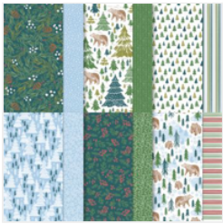
A Walk In The Forest 12" X 12" (30.5 X 30.5 Cm) Designer Series Paper - 162377