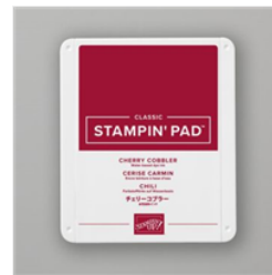
Cherry Cobbler Classic Stampin' Pad - 147083