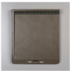
Simply Scored Scoring Tool - 122334