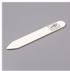
Bone Folder - 102300