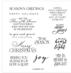
Brightest Glow Cling Stamp Set (English) - 159542