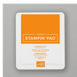
Pumpkin Pie Classic Stampin' Pad - 147086