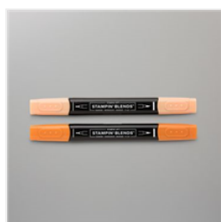
Pumpkin Pie Stampin' Blends Combo Pack - 154897