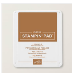
Pecan Pie Classic Stampin' Pad - 161665