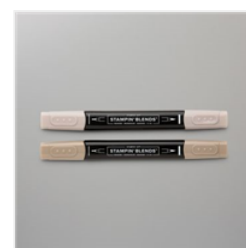
Crumb Cake Stampin' Blends Combo Pack - 154882