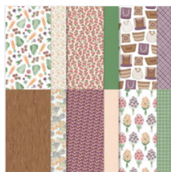
To Market 12" X 12" (30.5 X 30.5 Cm) Designer Series Paper - 163421