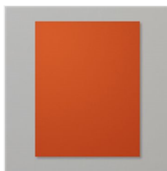
Cajun Craze 8-1/2" X 11" Cardstock - 119684