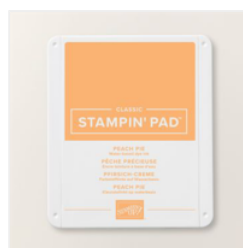
Peach Pie Classic Stampin' Pad - 163810