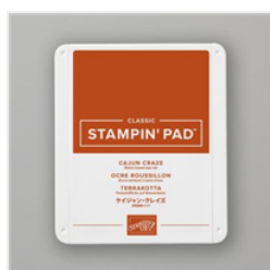
Cajun Craze Classic Stampin' Pad - 147085