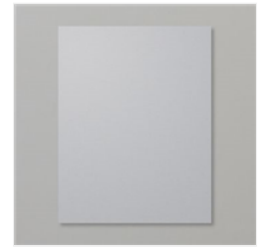
Smoky Slate 8-1/2" X 11" Cardstock - 131202 Price: $8.75