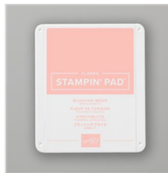
Blushing Bride Classic Stampin' Pad - 147100 Price: $7.50