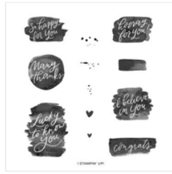
Lucky You Cling Stamp Set - 158014 Price: $20.00