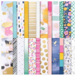
Abstract Beauty 4" X 6" (10.2 X 15.2 Cm) Specialty Designer Series Paper - 158039 Price: $15.00

Jackie Beers jackie@jackiebeers.com Bluelinestamping.com