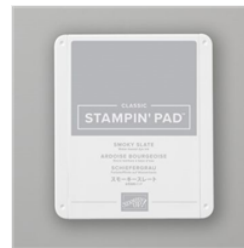
Smoky Slate Classic Stampin' Pad - 147113 Price: $7.50