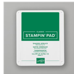
Shaded Spruce Classic Stampin' Pad - 147088