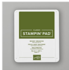
Mossy Meadow Classic Stampin' Pad - 147111