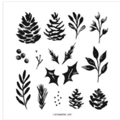
Christmas Season Photopolymer Stamp Set - 156293