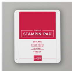
Real Red Classic Stampin' Pad - 147084