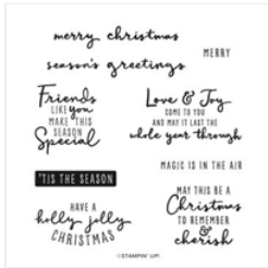
Christmas To Remember Cling Stamp Set (English) - 156300