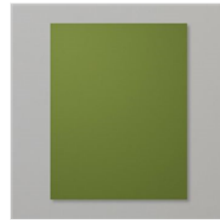
Mossy Meadow 8-1/2" X 11" Cardstock - 133676