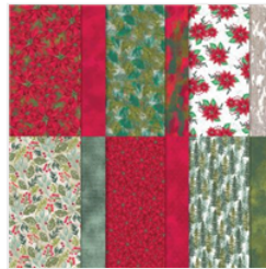
Boughs Of Holly 12" X 12" (30.5 X 30.5 Cm) Designer Series Paper - 159600