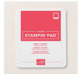
Sweet Sorbet Classic Stampin' Pad - 159216