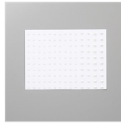
Pearl Basic Jewels - 144219