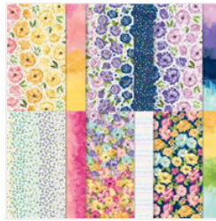
Hues Of Happiness 12" X 12" (30.5 X 30.5 Cm) Designer Series Paper - 158822