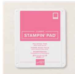
Polished Pink Classic Stampin' Pad - 155712