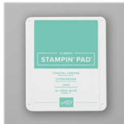
Coastal Cabana Classic Stampin' Pad - 147097