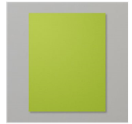
Granny Apple Green 8-1/2" X 11" Cardstock - 146990