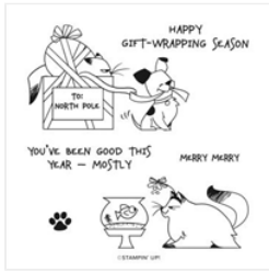
North Pole Mischief Cling Stamp Set (English) - 159770