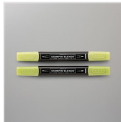
Granny Apple Green Stampin' Blends Combo Pack - 154885