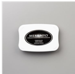
Tuxedo Black Memento Ink Pad - 132708