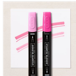
Polished Pink Stampin' Blends Combo Pack - 155520