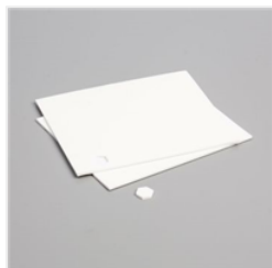
Stampin' Dimensionals - 104430