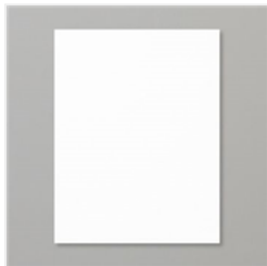
Basic White 8-1/2" X 11" Cardstock - 159276