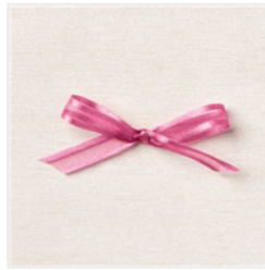
Polished Pink 3/8" (1 Cm) Open Weave Ribbon - 155714