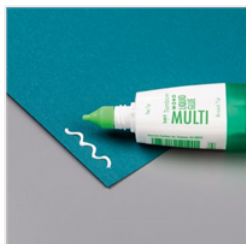
Multipurpose Liquid Glue - 110755