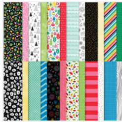
Celebrate Everything 12" X 12" (30.5 X 30.5 Cm) Designer Series Paper - 159913