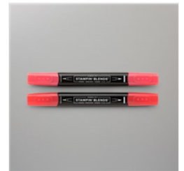
Poppy Parade Stampin' Blends Combo Pack - 154958