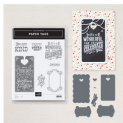
Paper Tags Bundle (English) - 165462

Jackie Beers jackie@jackiebeers.com Bluelinestamping.com