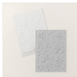
Stone & Vine 3D Embossing Folder - 166990