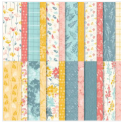
Inked Botanicals 6" X 6" (15.2 X 15.2 Cm) Designer Series Paper - 161157