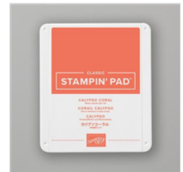
Calypso Coral Classic Stampin' Pad - 147101