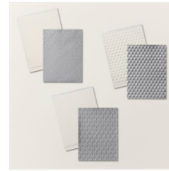
Basics 3D Embossing Folders - 161598