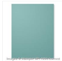
Lost Lagoon 8-1/2" X 11" Cardstock - 133679