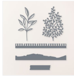
Gorgeously Made Dies - 161202