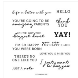
Happy Labels Photopolymer Stamp Set (English) - 160856