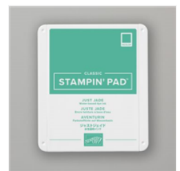
Just Jade Classic Stampin' Pad - 153115