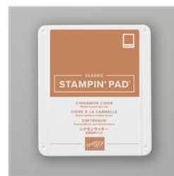
Cinnamon Cider Classic Stampin' Pad - 153114