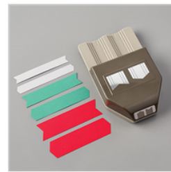
Banners Pick A Punch - 153608