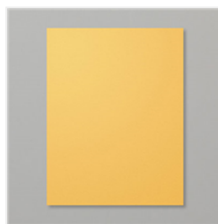
Bumblebee 8-1/2" X 11" Cardstock - 153077