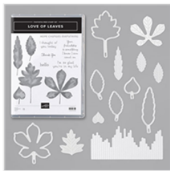
Love Of Leaves Bundle (English) - 155195

Jackie Beers jackie@jackiebeers.com Bluelinestamping.com