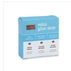
Glue Dots - 103683