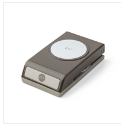
2-1/4" (5.7 Cm) Circle Punch - 143720