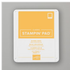
Bumblebee Classic Stampin' Pad - 153116