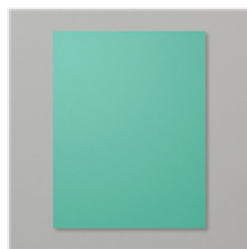
Just Jade 8-1/2" X 11" Cardstock - 153079