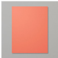
Calypso Coral 8- 1/2" X 11" Cardstock - 122925