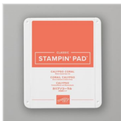
Calypso Coral Classic Stampin' Pad - 147101