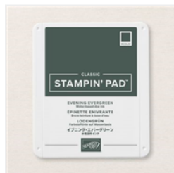
Evening Evergreen Classic Stampin' Pad - 155576