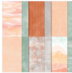
Delicate Desert 12" X 12" (30.5 X 30.5 Cm) Designer Series Paper - 160521