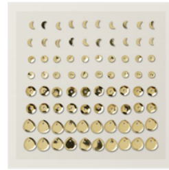
Gold Faceted Adhesive-Backed Sequins - 160536