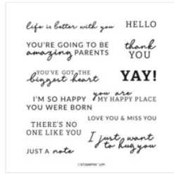
Happy Labels Cling Stamp Set (English) - 160685