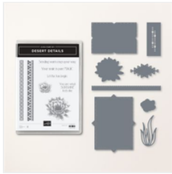
Desert Details Bundle (English) - 160532