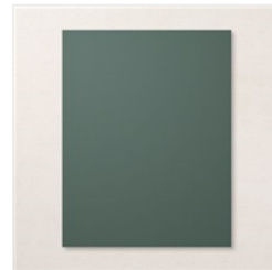
Evening Evergreen 8-1/2" X 11" Cardstock - 155574