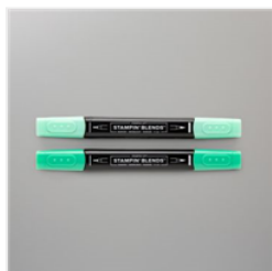
Shaded Spruce Stampin' Blends Combo Pack - 154903