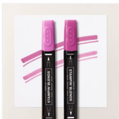
Berry Burst Stampin' Blends Combo Pack - 161681