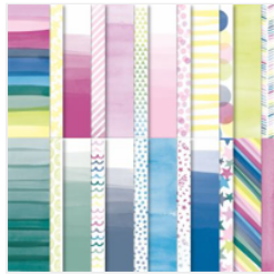
Bright & Beautiful 6" X 6" (15.2 X 15.2 Cm) Designer Series Paper - 161449