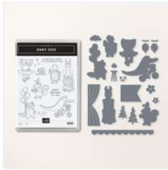
Zany Zoo Bundle (English) - 161315