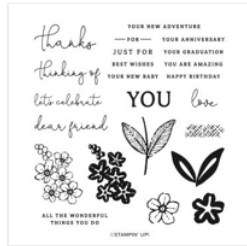
Sentimental Park Photopolymer Stamp Set (English) - 160561