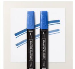
Blueberry Bushel Stampin' Blends Combo Pack - 161679