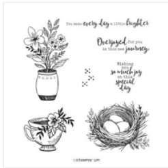
Everyday Details Cling Stamp Set (English) - 162861