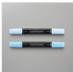
Balmy Blue Stampin' Blends Combo Pack - 154830