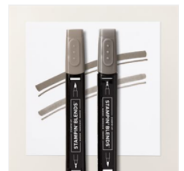
Pebbled Path Stampin' Blends Combo Pack - 161658