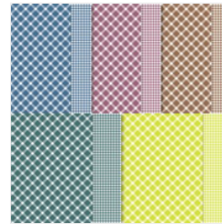
Glorious Gingham 6" X 6" (15.2 X 15.2 Cm) Designer Series Paper - 163170