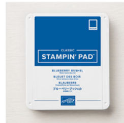
Blueberry Bushel Classic Stampin' Pad - 147138