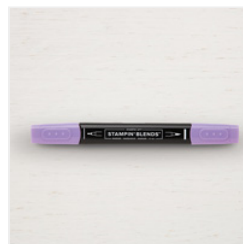
Highland Heather Dark Stampin' Blends Marker - 146883