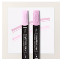
Bubble Bath Stampin' Blends Combo Pack - 161675