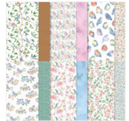
Flight & Airy 12" X 12" (30.5 X 30.5 Cm) Designer Series Paper - 162977