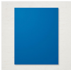
Blueberry Bushel 8-1/2" X 11" Cardstock - 146968