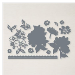
Penned Flowers Dies - 155557