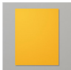
Mango Melody 8- 1/2" X 11" Cardstock - 146989