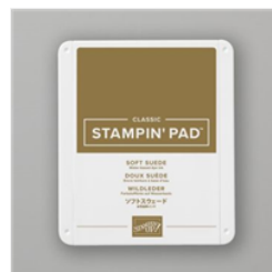
Soft Suede Classic Stampin' Pad - 147115