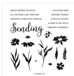
Sending Smiles Photopolymer Stamp Set (English) - 158701