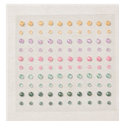
2021-2023 In Color Opal Rounds - 159185