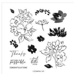
Hand-Penned Petals Photopolymer Stamp Set - 155070