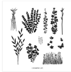
Painted Lavender Photopolymer Stamp Set - 162594