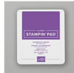
Gorgeous Grape Classic Stampin' Pad - 147099