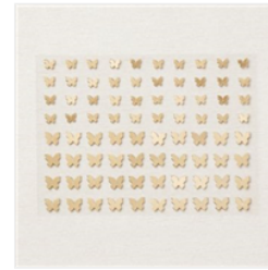
Brushed Brass Butterflies - 158136