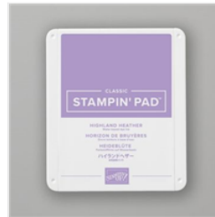
Highland Heather Classic Stampin' Pad - 147103