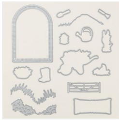
Garden Meadow Dies - 162740