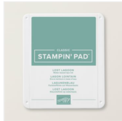
Lost Lagoon Classic Stampin' Pad - 161678