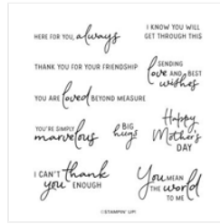
Perennial Postage Cling Stamp Set (English) - 162598