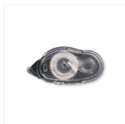
Snail Adhesive - 104332