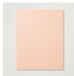
Petal Pink 8-1/2" X 11" Cardstock - 146985