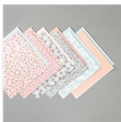
Parisian Blossoms Specialty Designer Series Paper - 151192