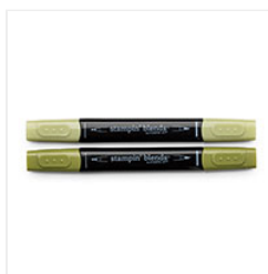
Old Olive Stampin' Blends Markers Combo Pack - 144597