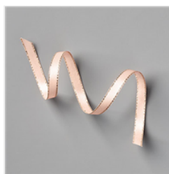
Petal Pink 1/4" (6.4 Mm) Metallic-Edge Ribbon - 151194