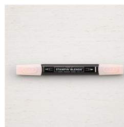
Petal Pink Dark Stampin' Blends Marker - 146871