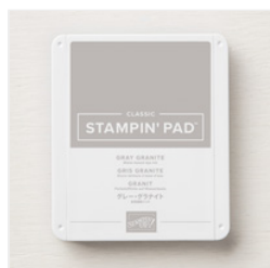
Gray Granite Classic Stampin' Pad - 147118