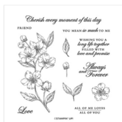
Forever Blossoms Cling Stamp Set (English) - 151457