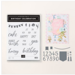
Birthday Celebration Bundle (English) - 164599