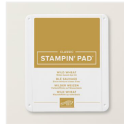
Wild Wheat Classic Stampin' Pad - 161651