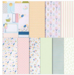
Wildflower Birthday 12" X 12" (30.5 X 30.5 Cm) Specialty Designer Series Paper - 164591