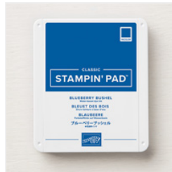
Blueberry Bushel Classic Stampin' Pad - 147138