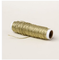
Gold Twisted Thread - 164603