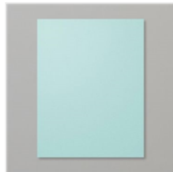
Pool Party 8-1/2" X 11" Cardstock - 122924