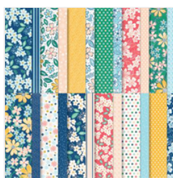
Regency Park 6" X 6" (15.2 X 15.2 Cm) Designer Series Paper - 160559