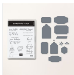
Something Fancy Bundle (English) - 160425