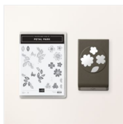
Petal Park Bundle (English) - 160577