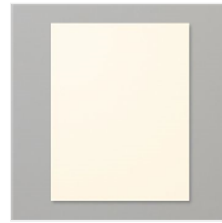
Very Vanilla 8-1/2" X 11" Thick Cardstock - 144237