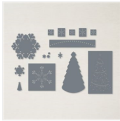
Twinkling Lights Dies - 159541

expressivelydeb@gmail.com http://www.expressivelydeb.com