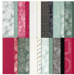
Lights Aglow 6" X 6" (15.2 X 15.2 Cm) Specialty Designer Series Paper - 159535