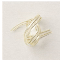
Gold & Vanilla 3/8" (1 Cm) Satin Edged Ribbon - 159555