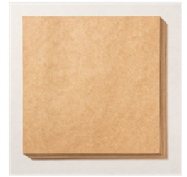
Kraft 6" X 6" (15.2 X 15.2 Cm) Paper Pack - 156325