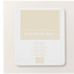
Basic Beige Classic Stampin' Pad - 163806