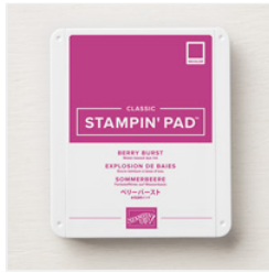
Berry Burst Classic Stampin' Pad - 147143