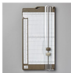
Paper Trimmer - 152392