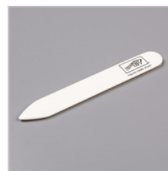
Bone Folder - 102300