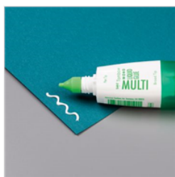
Multipurpose Liquid Glue - 110755