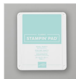
Pool Party Classic Stampin' Pad - 147107