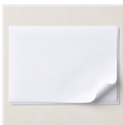
Stampin' Up! Masking Paper - 155480