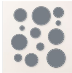
Spotlight On Nature Dies - 163580