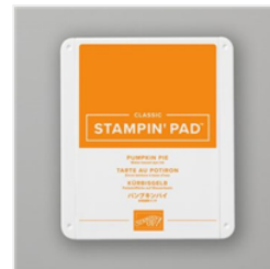
Pumpkin Pie Classic Stampin' Pad - 147086