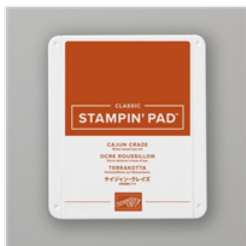
Cajun Craze Classic Stampin' Pad - 147085