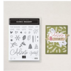
Iconic Imagery Photopolymer Stamp Set (English) - 164194