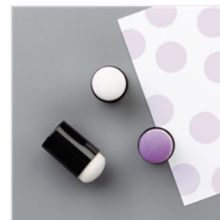
Sponge Daubers - 133773