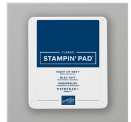
Night Of Navy Classic Stampin' Pad - 147110