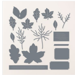
Autumn Leaves Dies - 162185