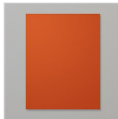
Cajun Craze 8-1/2" X 11" Cardstock - 119684