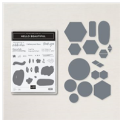
Hello Beautiful Bundle (English) - 158047