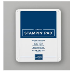
Night Of Navy Classic Stampin' Pad - 147110