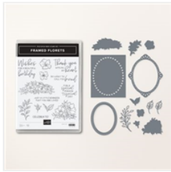
Framed Florets Bundle (English) - 162407