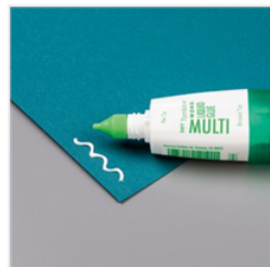
Multipurpose Liquid Glue - 110755