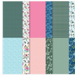
Fitting Florets 12" X 12" (30.5 X 30.5 Cm) Designer Series Paper - 161814