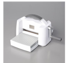
Stampin' Cut & Emboss Machine - 149653