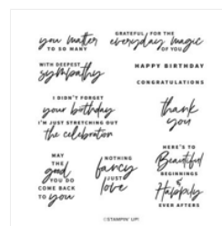
Something Fancy Cling Stamp Set (English) - 160416