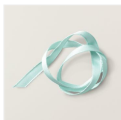
Pool Party 3/8" (1 Cm) Grosgrain Ribbon - 160430