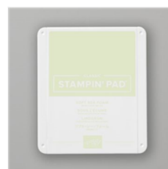
Soft Sea Foam Classic Stampin' Pad - 147102