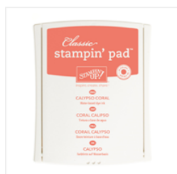
Calypso Coral Classic Stampin' Pad - 126983