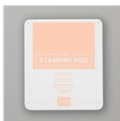
Petal Pink Classic Stampin' Pad - 147108