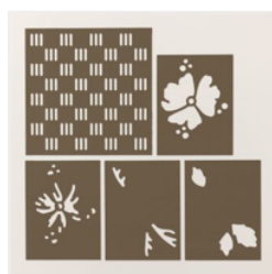
Loveliest Layers Decorative Masks - 164426