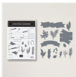
Christmas Banners Bundle (English) - 159993