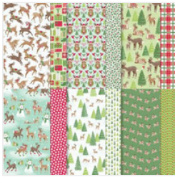
Reindeer Days 12" X 12" (30.5 X 30.5 Cm) Designer Series Paper - 164166