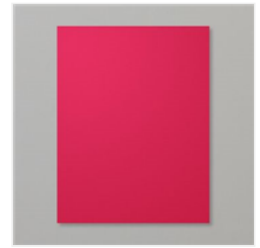
Real Red 8-1/2" X 11" Cardstock - 102482