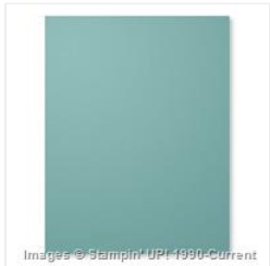
Lost Lagoon 8-1/2" X 11" Cardstock - 133679