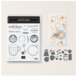
Latte Love Bundle (English) - 163461

lennyandmary1@msn.com www.maryblocher.stampinup.net