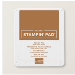
Pecan Pie Classic Stampin' Pad - 161665