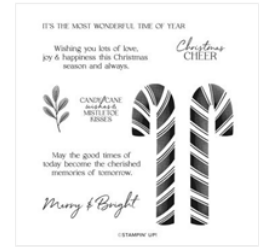
Sweet Candy Canes Cling Stamp Set (English) - 159560