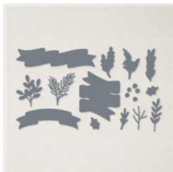
Christmas Banner Dies - 159576