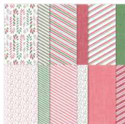
Sweetest Christmas 12" X 12" (30.5 X 30.5 Cm) Designer Series Paper - 159559