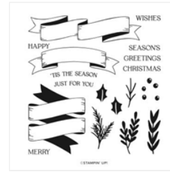
Christmas Banners Photopolymer Stamp Set (English) - 159570