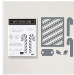
Sweet Candy Canes Bundle (English) - 161052