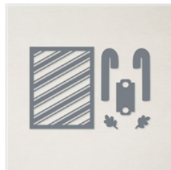
Candy Canes Dies - 159569