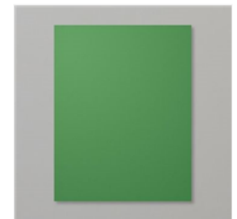
Garden Green 8-1/2" X 11" Cardstock - 102584