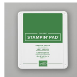
Garden Green Classic Stampin' Pad - 147089