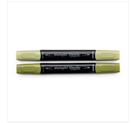
Old Olive Stampin' Blends Marker Combo Pack - 144597