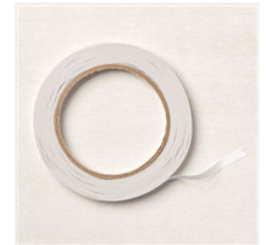
Tear & Tape Adhesive - 154031