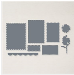
Scalloped Contours Dies - 155560