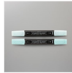
Pool Party Stampin' Blends Marker Combo Pack - 154894