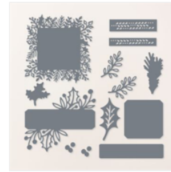
Christmas Classics Dies - 161976