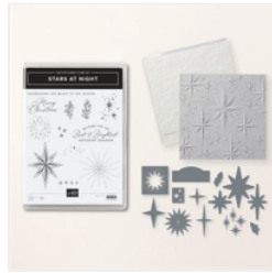
Stars At Night Bundle (English) - 162007