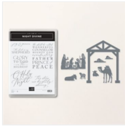
Night Divine Bundle (English) - 161997