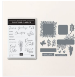
Christmas Classics Bundle (English) - 161977