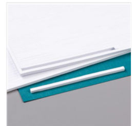
Foam Adhesive Strips - 141825