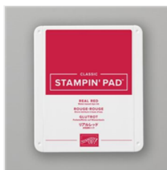
Real Red Classic Stampin' Pad - 147084