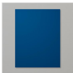
Night Of Navy 8-1/2" X 11" Cardstock - 100867