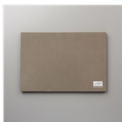
Stampin' Pierce Mat - 126199