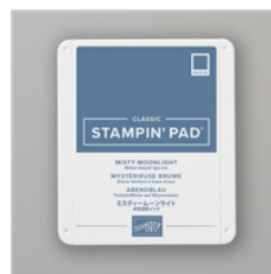
Misty Moonlight Classic Stampin' Pad - 153118