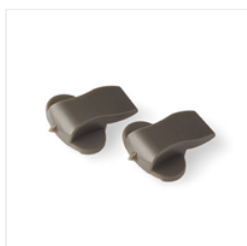
Stampin' Trimmer Cutting Blades - 126995