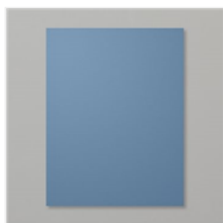
Misty Moonlight 8-1/2" X 11" Cardstock - 153081