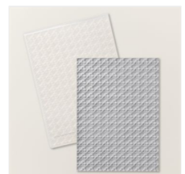
Cane Weave 3D Embossing Folder - 160580