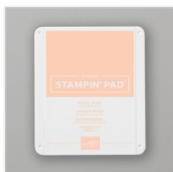
Petal Pink Classic Stampin' Pad - 147108