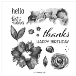
Artistically Inked Cling Stamp Set - 154542