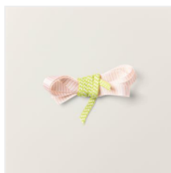
Ribbon Duo Combo Pack - 161318