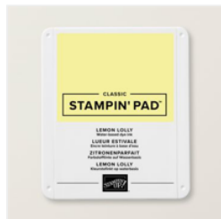
Lemon Lolly Classic Stampin' Pad - 161666