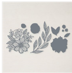
Artistic Dies - 155371