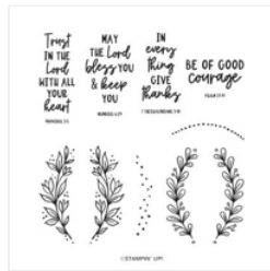
Courage & Faith Cling Stamp Set (English) - 161500