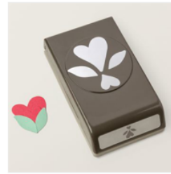
Country Bouquet Punch - 160382