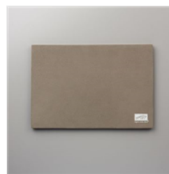
Stampin' Pierce Mat - 126199