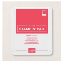
Sweet Sorbet Classic Stampin' Pad - 159216