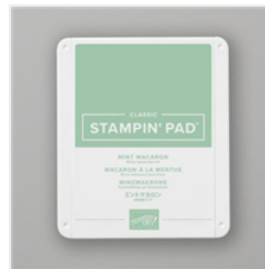
Mint Macaron Classic Stampin' Pad - 147106