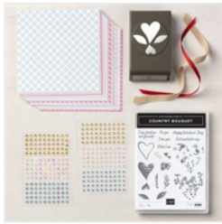
Country Floral Lane Suite Collection (English) - 160390

Bonnie@Stampingwithbonnielynn.com www.stampingwithbonnielynn.com