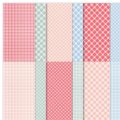
Country Gingham 6" X 6" (15.2 X 15.2 Cm) Designer Series Paper - 160388