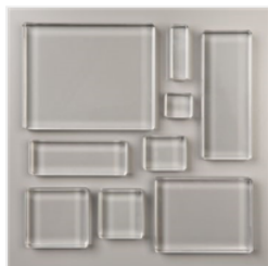
Clear Block Bundle - 118491