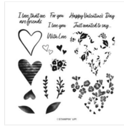
Country Bouquet Photopolymer Stamp Set (English) - 160377