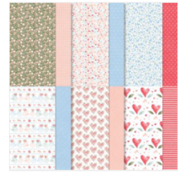
Country Floral Lane 12" X 12" (30.5 X 30.5 Cm) Designer Series Paper - 160375