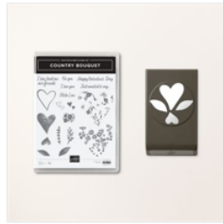
Country Bouquet Bundle (English) - 160383