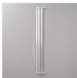
Paper Trimmer Metric Blade Guide - 154980