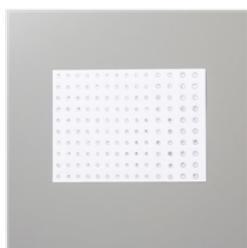
Rhinestone Basic Jewels - 144220