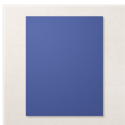
Starry Sky 8-1/2" X 11" Cardstock - 159263