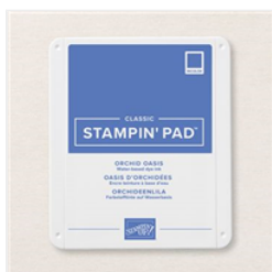
Orchid Oasis Classic Stampin' Pad - 159214