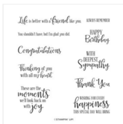
Peaceful Moments Cling Stamp Set (En) - 151595