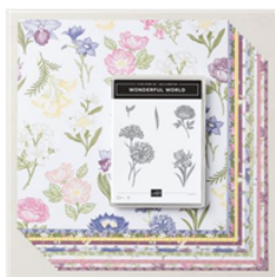
Wonderful World Bundle (English) - 159918