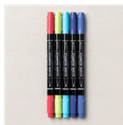
Stampin' Write Marker In Color 2022-2024 - 159219