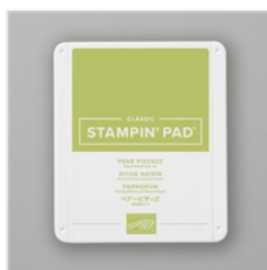
Pear Pizzazz Classic Stampin' Pad - 147104