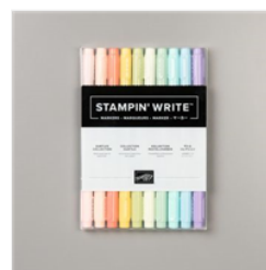
Subtles Stampin' Write Markers - 147156