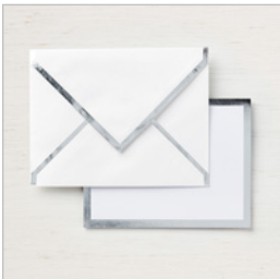
Silver Foil-Edged Cards & Envelopes - 147900