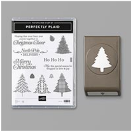
Perfectly Plaid Bundle (En) - 151143