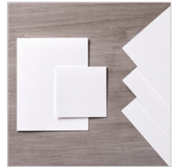
Whisper White 8-1/2" X 11" Thick Cardstock