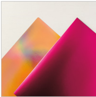
Grapefruit Grove & Lovely Lipstick Foil Sheets