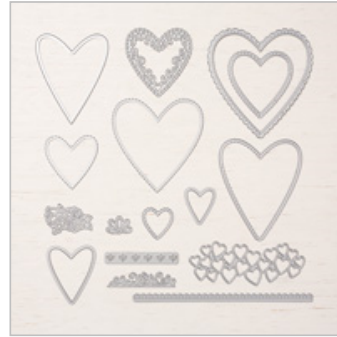
Be Mine Stitched Framelits Dies