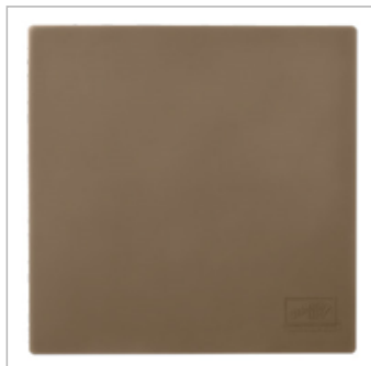
Silicone Craft Sheet