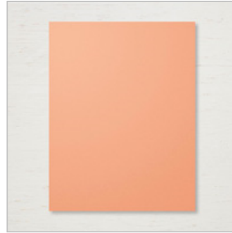
Grapefruit Grove 8-1/2 X 11" Cardstock