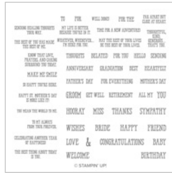
Well Said Cling Stamp Set