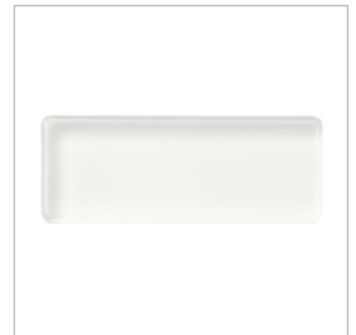
Clear Block I