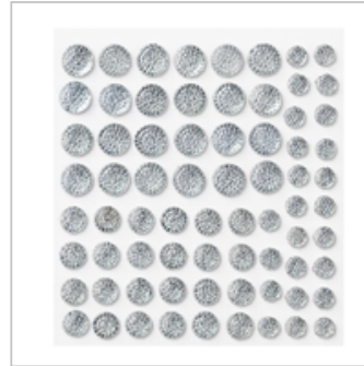
Clear Faceted Gems