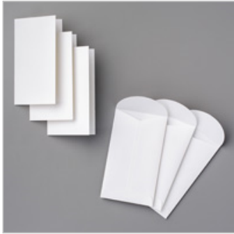
Whisper White Narrow Note Cards & Envelopes