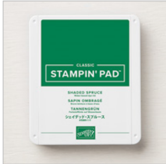
Shaded Spruce Classic Stampin' Pad