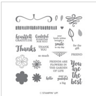
A Big Thank You Photopolymer Stamp Set

Designer Series Paper 146916 Price: $11.00