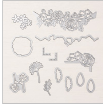
Lovely Flowers Edgelits Dies