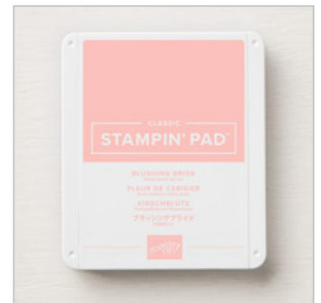
Blushing Bride Classic Stampin' Pad