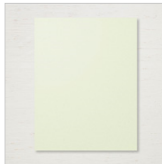
Soft Sea Foam 8-1/2" X 11" Cardstock