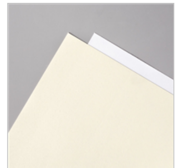
Very Vanilla 8-1/2" X 11" Thick Cardstock