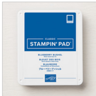
Blueberry Bushel Classic Stampin' Pad