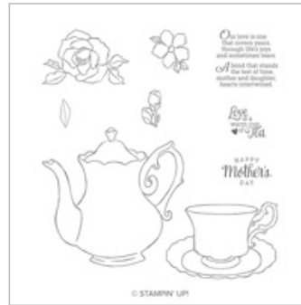
Tea Together Cling