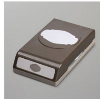
Story Label Punch