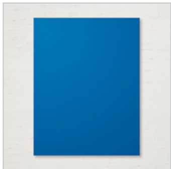
Blueberry Bushel 8-1/2" X 11" Cardstock